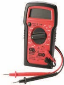
Gardner Bender 500 VAC, 600 VDC 2 meg Ohm, Digital Multimeter 1 pk $28.99

Designed to work on most household appliances and equipped with an easy-to-read 3.5 inch digital display this Gardner Bender multimeter features rubber housing to promote grip. Engineered with four testing functions; AC Voltage to 500V, DC Voltage to 600V, Resistance to 2 meg Ohms and Battery Testing for 1.5V, 9V and 12V batteries[...]. Tight and secure input jacks keep the included 26 test leads fixed firmly in place during testing. The unit comes pre-packaged with leads. Tester is rated CAT III 600V and conforms to UL 61010-1 standards and certified to CAN/CSA C22.2. (Requires 9V battery - not included).