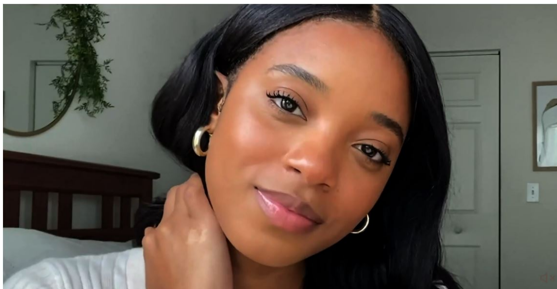
Doc 5 Visuals of the website with 2 models